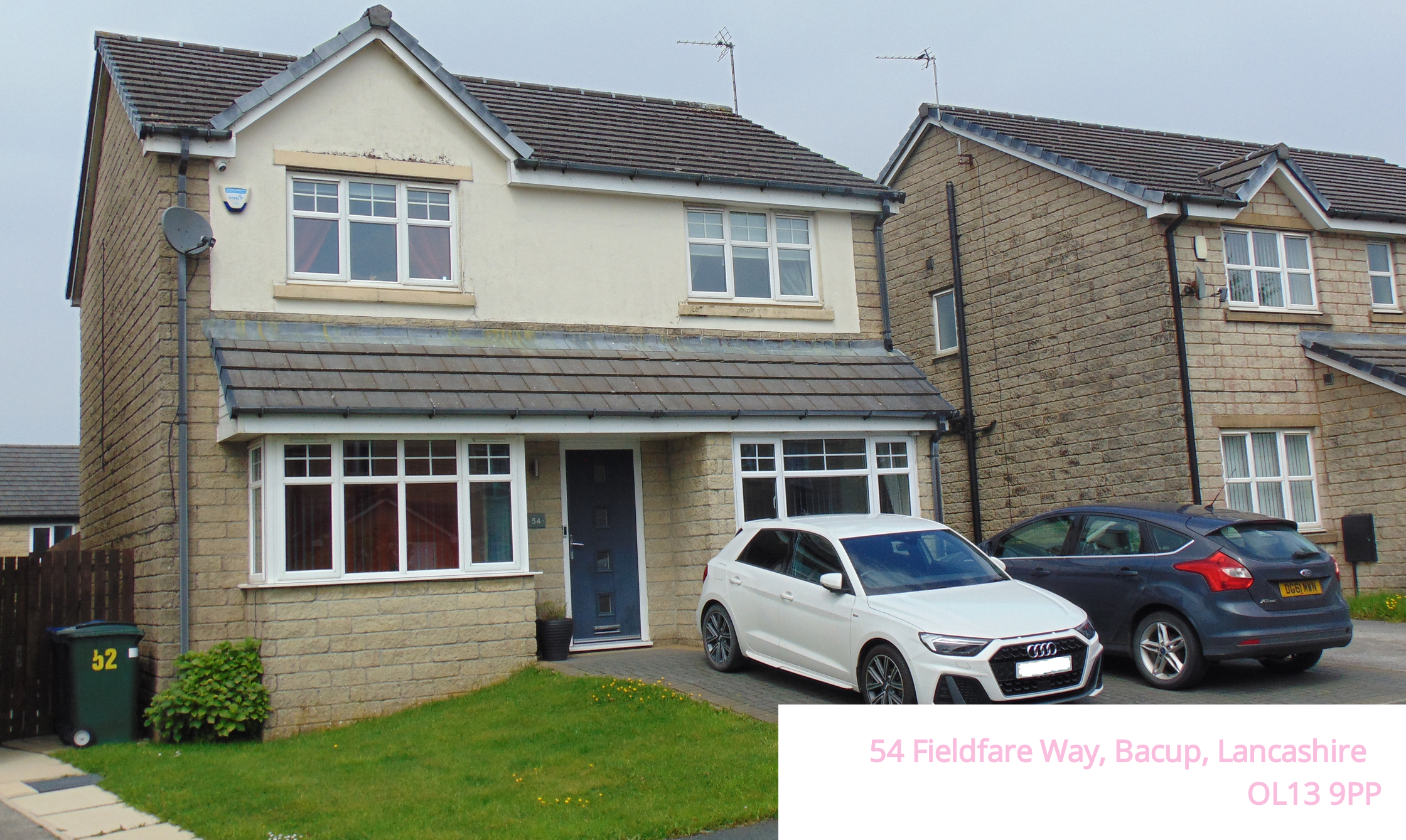
54 Fieldfare Way, Bacup, Lancashire OL13 9PP