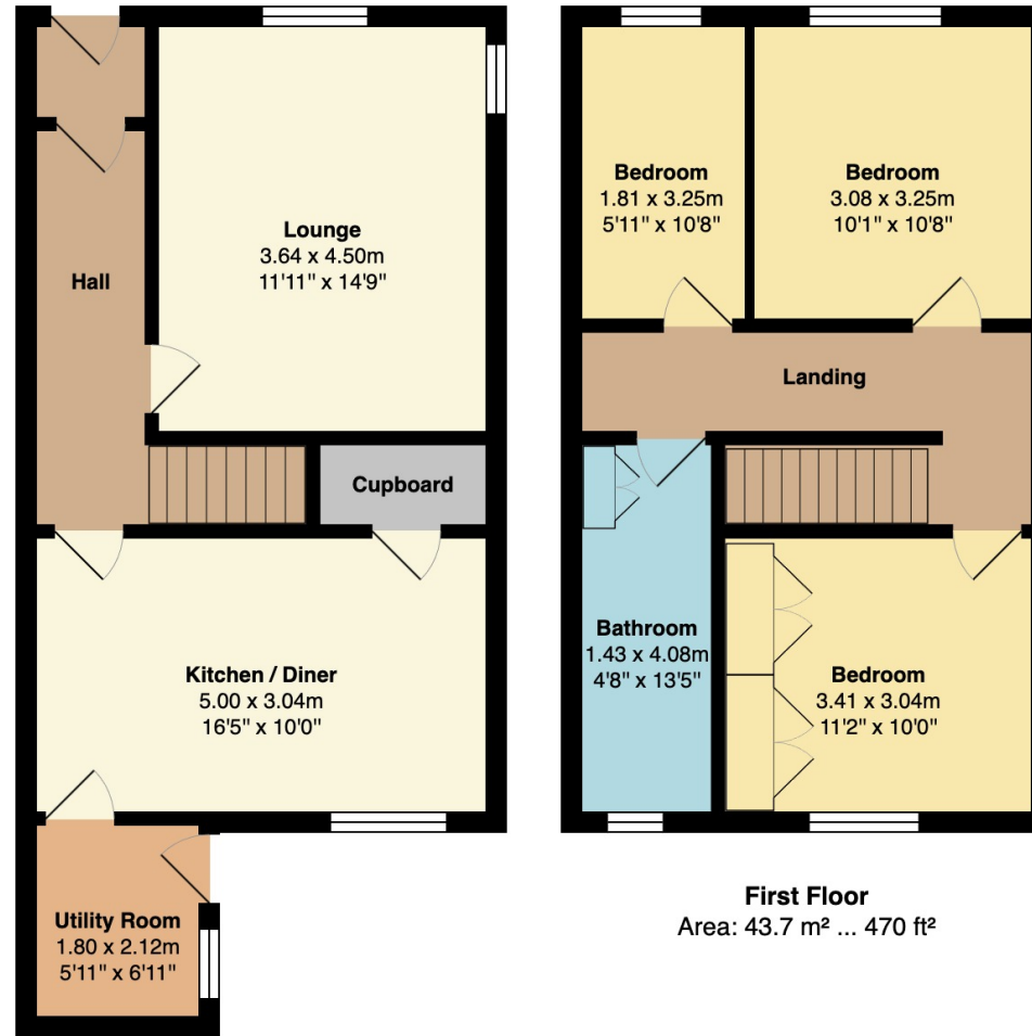
Ground Floor Area: 47.8 m 2 ... 515 ft 2