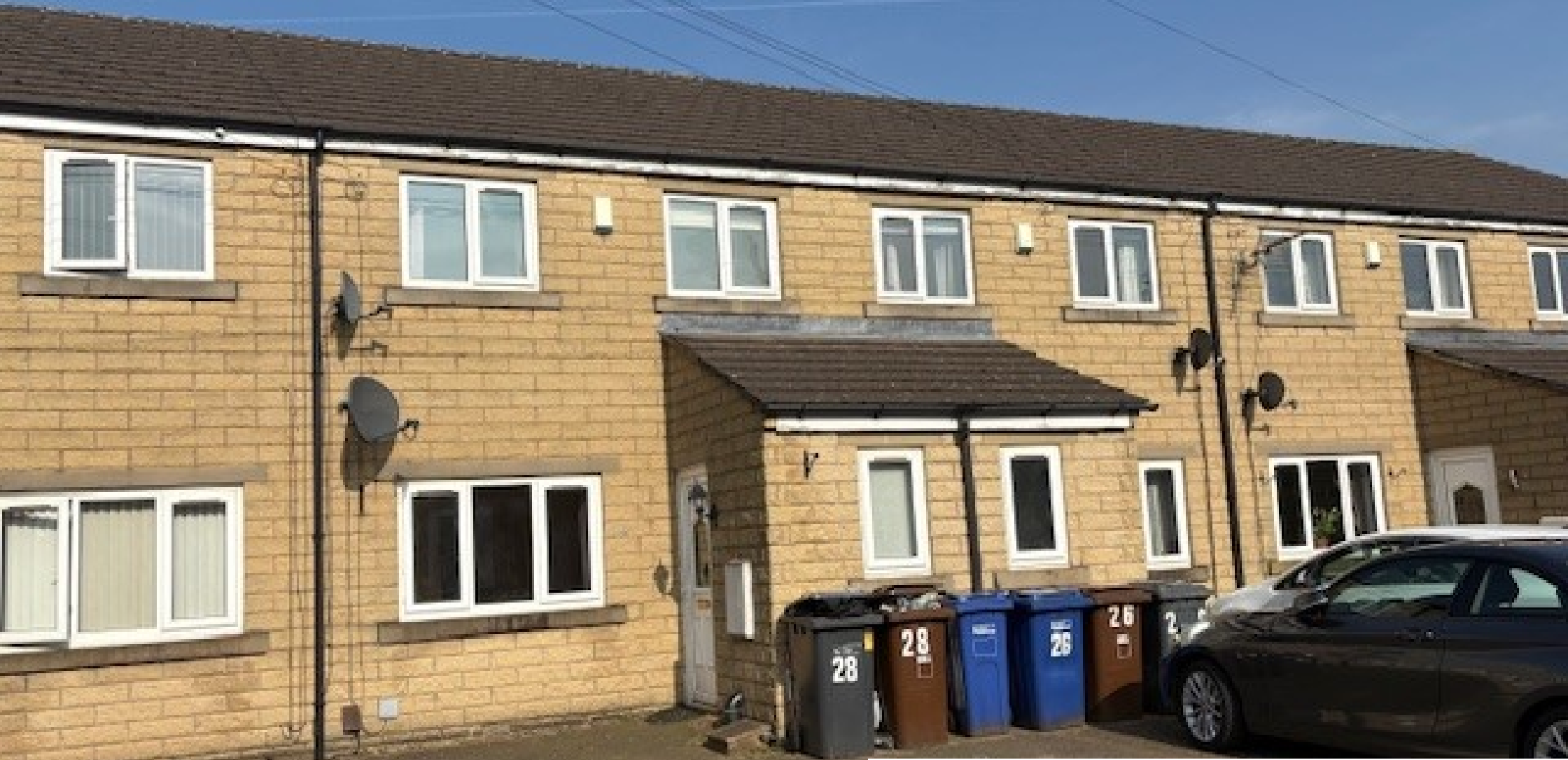
28 Lee Road, Nelson, Lancashire BB9 8SD